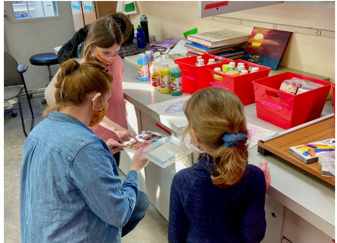
February class exploring pastels and water techniques

During March, we will discuss American Modernism with Georgia O'Keeffe and the Stieglitz Circle as a focus. Artists involved in this movement depicted familiar things with an abstracted and blown-up view, and students can look forward to doing this in class as well.