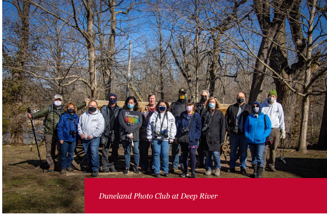
Duneland Photo Club at Deep River