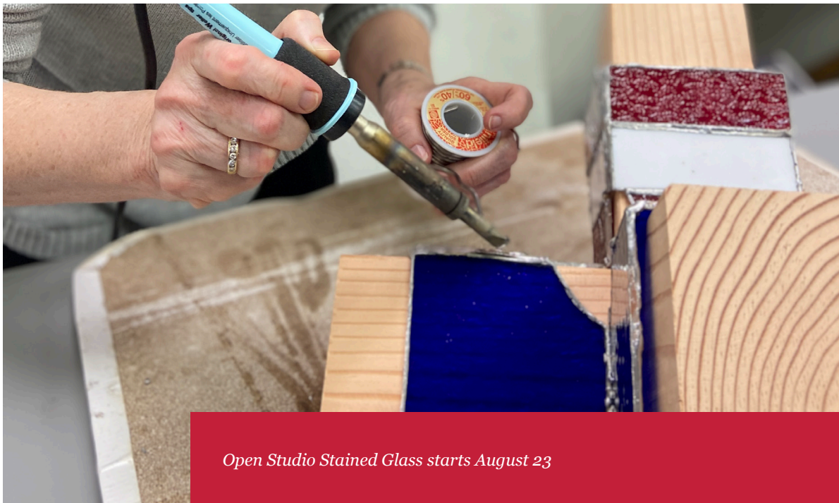
Open Studio Stained Glass starts August 23

Tuition is $185 for non-members and $165 for current CAC members. All materials are provided, including 12 lbs. of clay.