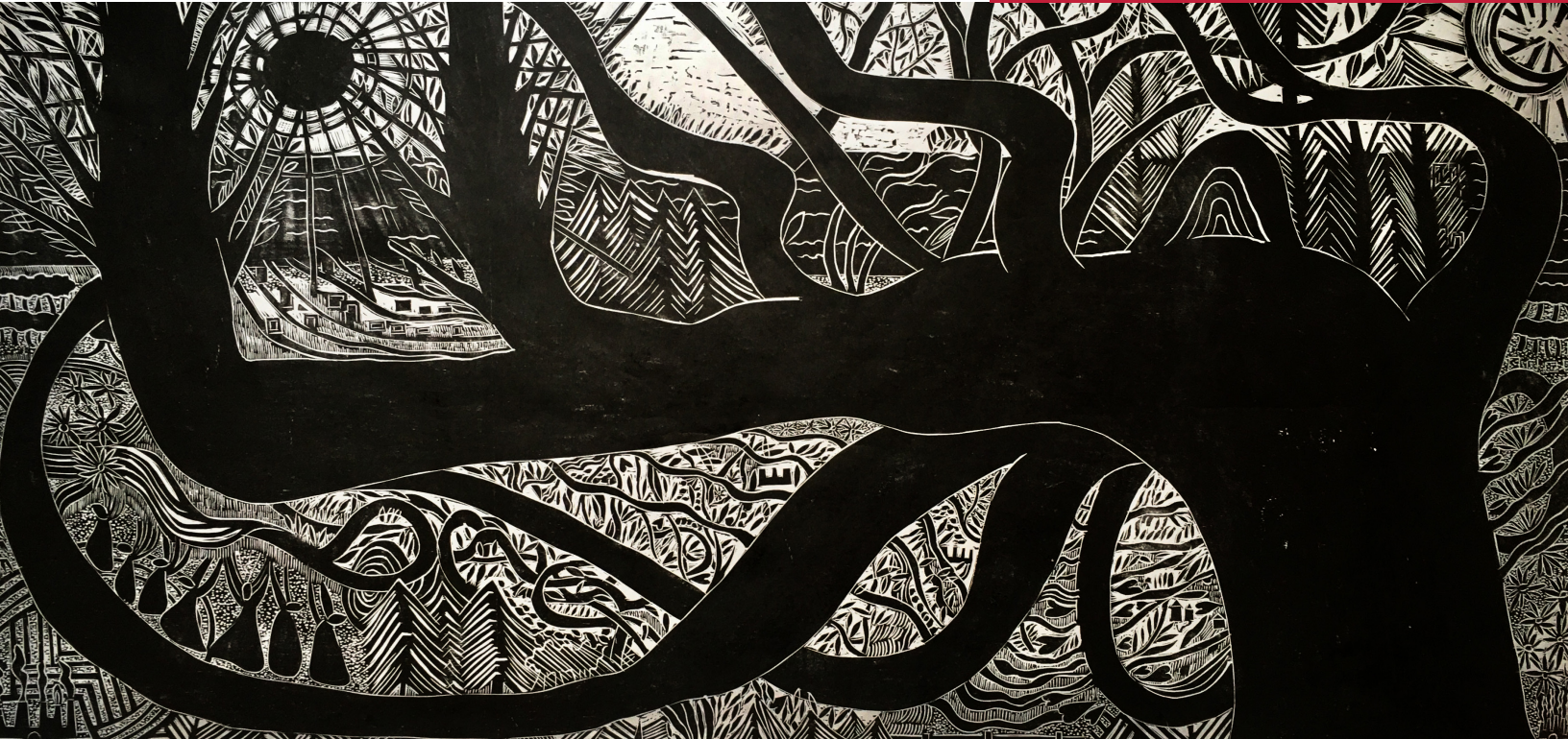
Photo: Corey Hagelberg, Bent but Unbroken , 2016, 24 x 48 in, woodcut print