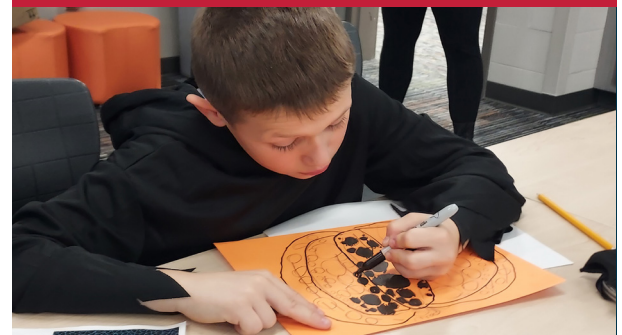
Young artist in the Portage YMCA after school art program