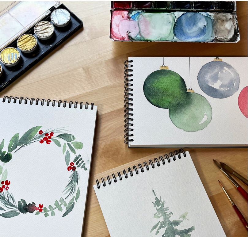
Holiday Watercolor Workshop - December 9th

Tuition is $70 for non-members / $63 for current CAC members, supplies included