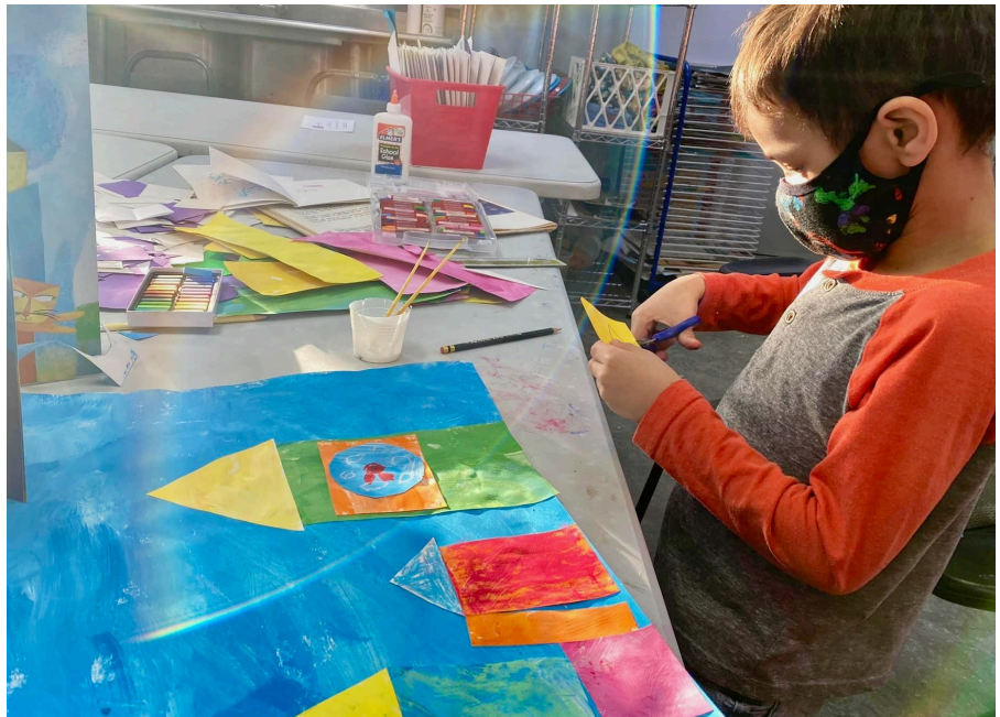
Art student explores mixed media

Masks are still required for on-site classes at CAC regardless of vaccination status. Visit our website for our COVID-19 guidelines. There will be no make-up days for missed classes at this time.