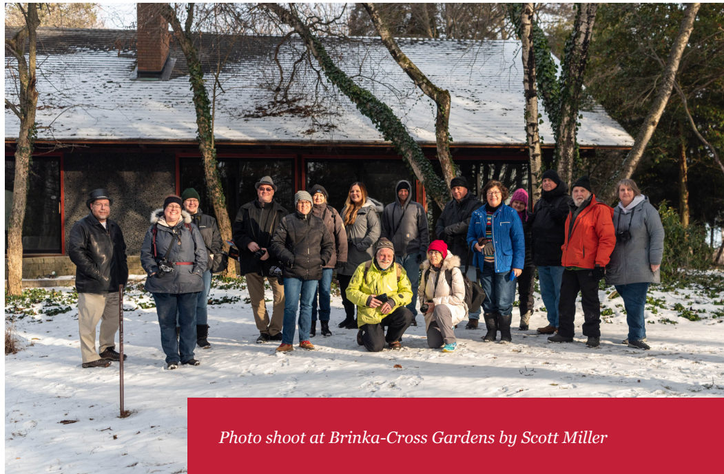
Photo shoot at Brincka-Cross Gardens

In January, we did headshots at the Memorial Opera House and also met for some winter