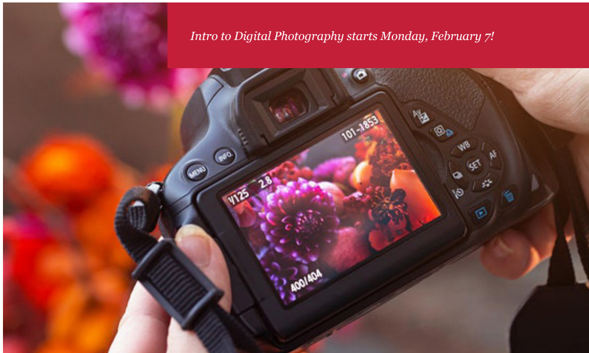
Intro to Digital Photography starts Monday, February 7!

Tuition is $55.00 and $45.00 for current CAC members.