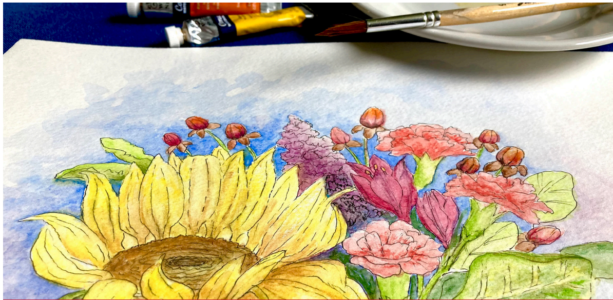
Exploring Watermedia Workshop on October 15

Tuition is $50.00 for non-members and $40.00 for current CAC members. All materials are provided, including glazing & firing.