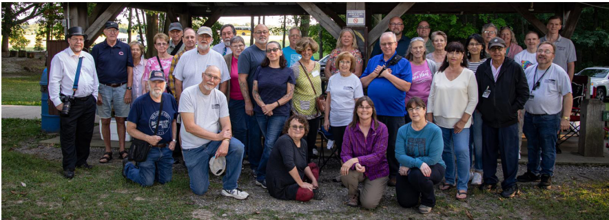
The Duneland Photography Club September meeting included a picnic at Sunset Hill Farm.

For more information, contact the club at DunelandPhotographyClub@gmail.com or find us on Facebook at https://www.facebook.com/dunelandphotoclub .