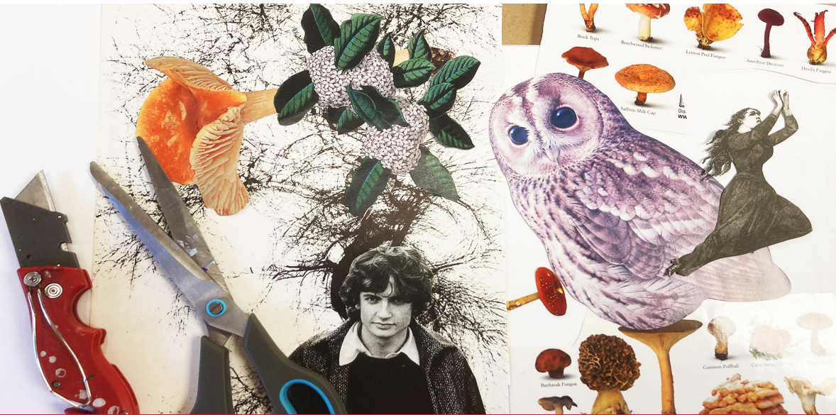
Mixed Media Collage Workshop on October 29