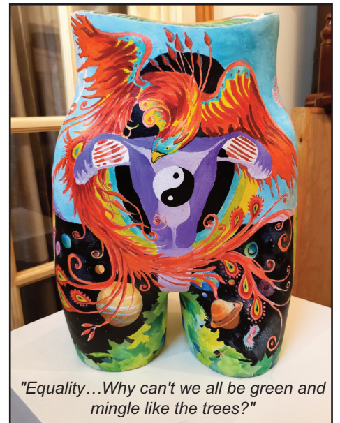
"Equality...Why can't we all be green and mingle like the trees?"

The exhibit concludes on Monday, November 9.