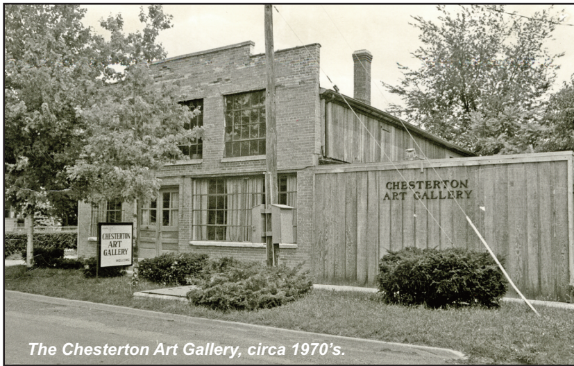
The Chesterton Art Gallery, circa 1970's.

The Association of Artists and Craftsmen of Porter County, the founding organization of the Chesterton Art Center turns 60 this month!